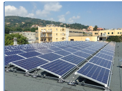
Storage, E-Car & PV

Developing a new concept of «Microgrid» for thermal and electrical supply of Smart Cities and/or industrial districts.