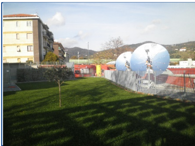
Concentrating Solar Power